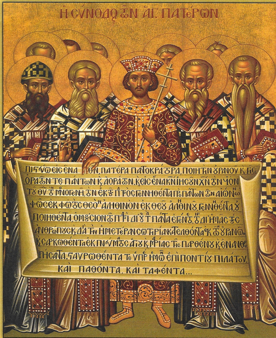
Icon of the Fathers of the First Ecumenical Council