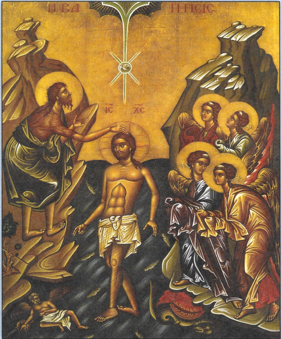
Icon of Theophany -- January 6th