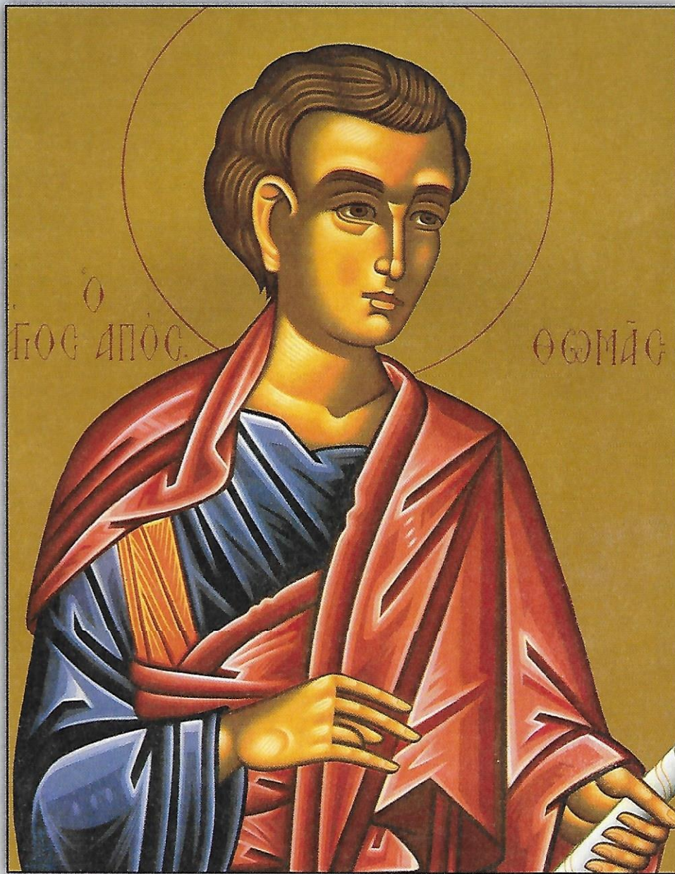
Icon of the Holy Apostle Thomas -- October 6th